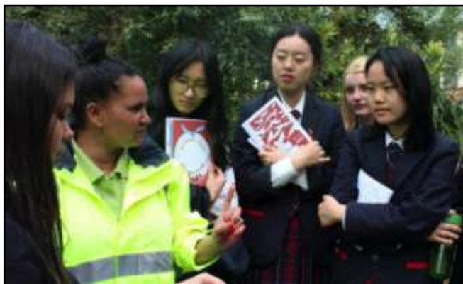
Learning about the history of the site and the importance to Aboriginal people.