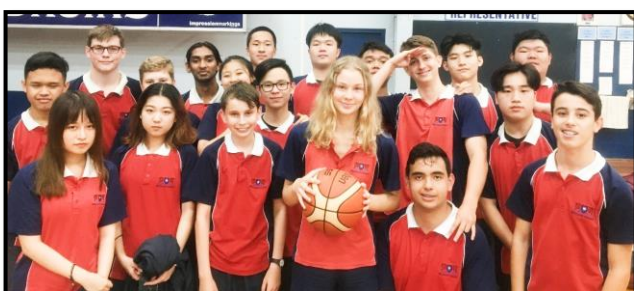
Macquarie Grammar School Squad

Finally, we came across the might of Amity College. Although our boys gave their best, it was evident that our opponents play on a regular basis as a team. This did not take away from the effort of our boys. As a result of losing this match, we did not progress into the final, yet finished third overall on the day– outstanding!