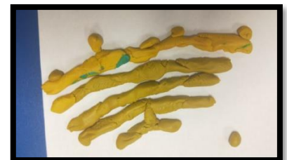
GOLGI APPARATUS by GLEB DMITRIEVICH 11

succeed with their studies. Students and Teachers are expected to produce and demonstrate the highest of educational standards attainable for the curriculum as it currently exists. As part of exemplary standards, teachers are required to constantly update and adjust the curriculum for maintenance of excellence in teaching and learning that addresses the student needs within the high school. The HSC results have reflected this through a very solid performance in all subject areas and some