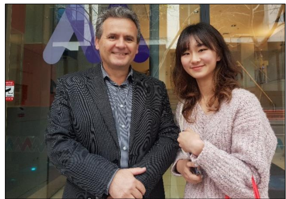
Soolim visits MGS (Alumi 2017)

Are the former students allowed to come into the school to visit teachers?