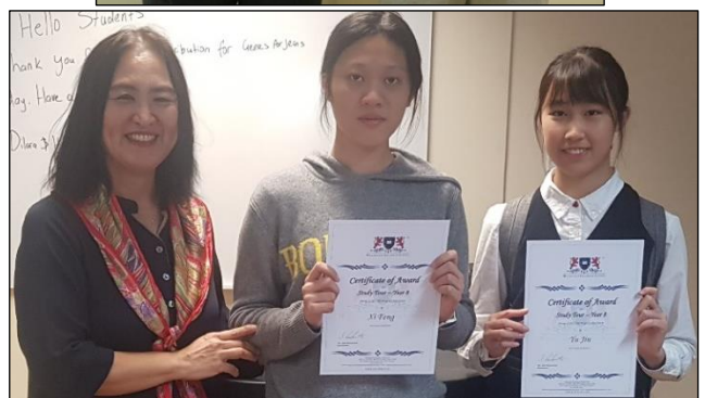
Study Tour students from China