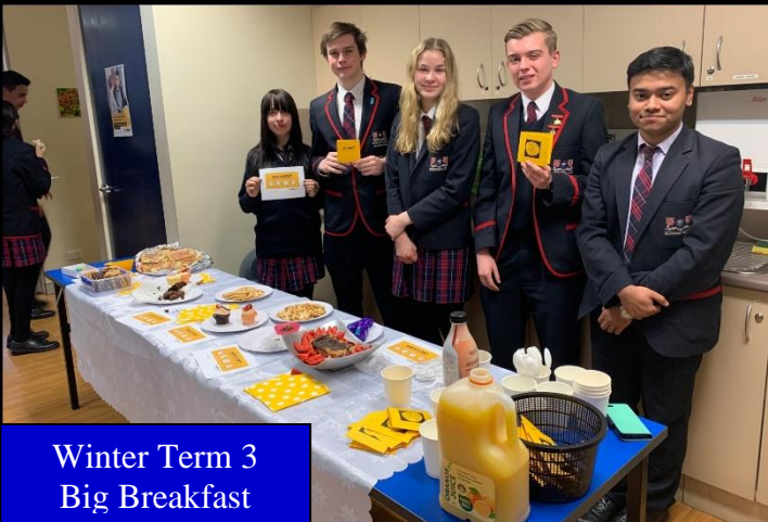
Winter Term 3 Big Breakfast