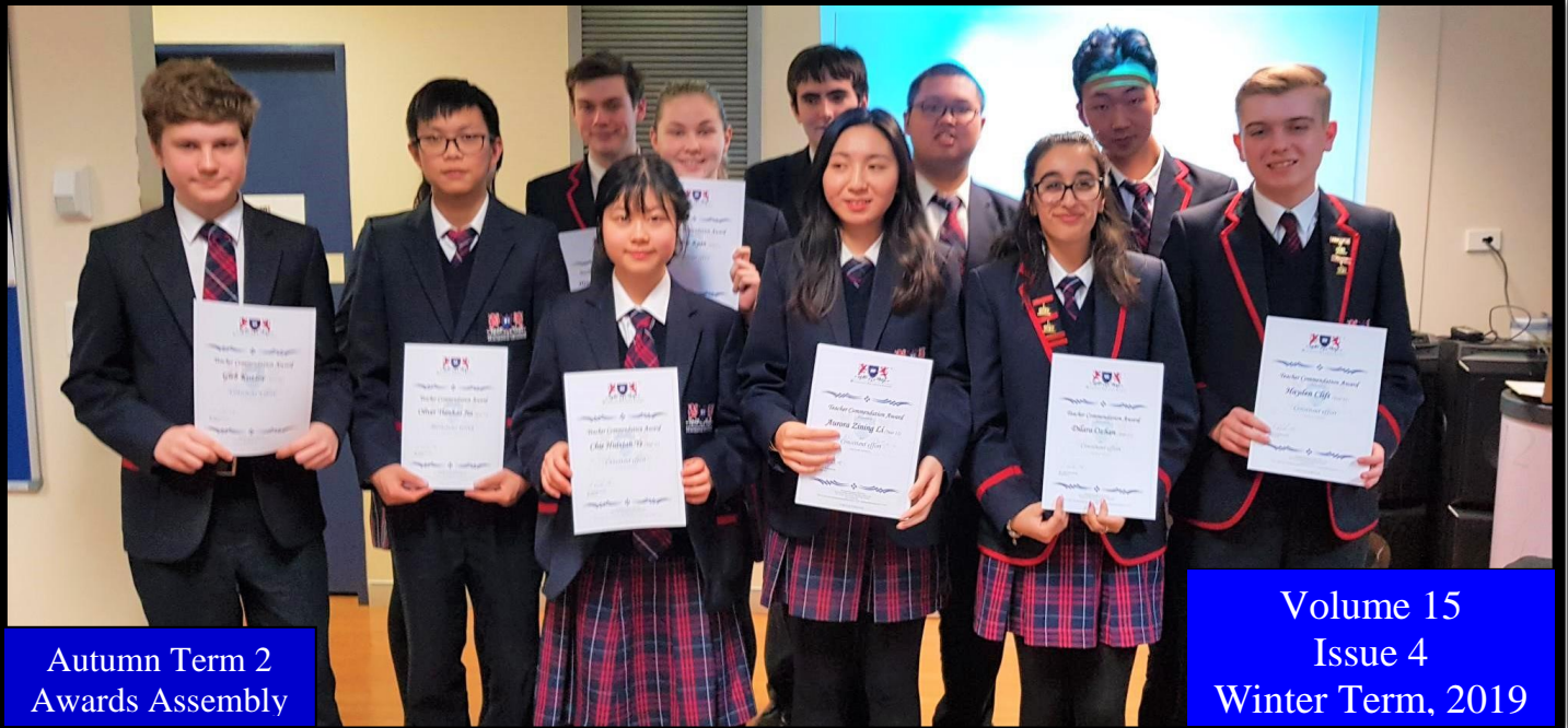
Autumn Term 2 Awards Assembly