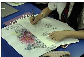
exhibit their work, develop its conceptual strength and gain inspiration for using various materials. This was a valuable experience and students happily engaged with the process of viewing the work in a gallery space. I look forward to seeing students work develop to the highest quality and standard throughout the year.

Year 12 HSC students will be focussing on completing their Body of Work and using their time effectively in class, at home and study periods. The HSC body of work demands quality, innovative designs and conceptual strength, students have been planning and beginning the process of creating their artworks. Students have visited ARTEXPRESS at the Art Gallery of NSW. This is an exhibition that focusses on the achievements of past HSC students from across NSW. Students will gain an understanding of how to