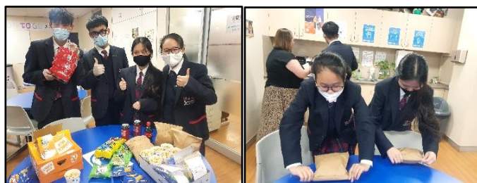
Students "popping" and packaging corn. Students filling the pre-orders ready for delivery.