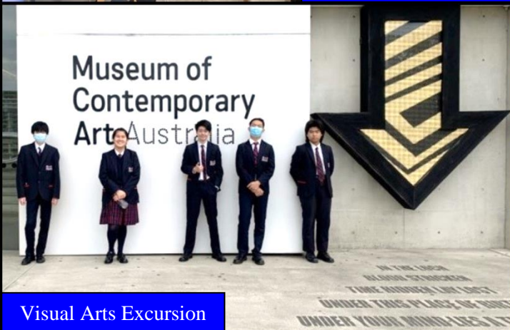
Visual Arts Excursion