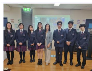
Term 3 Assembly & Year 12 Valedictory