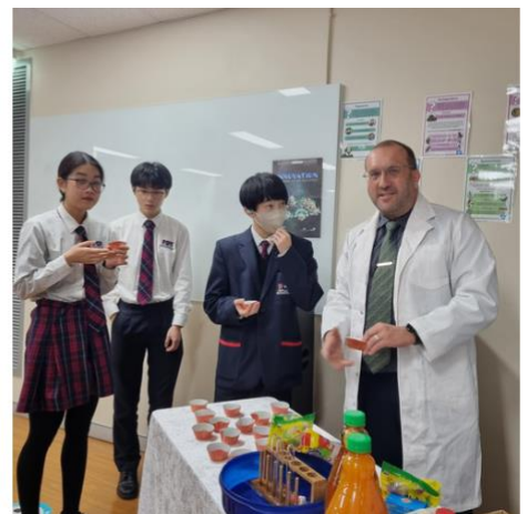
Term 3 Science Class