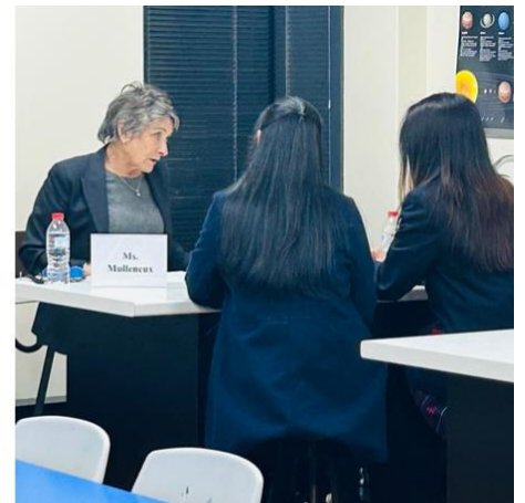
Term 3 Parent Teacher Interview