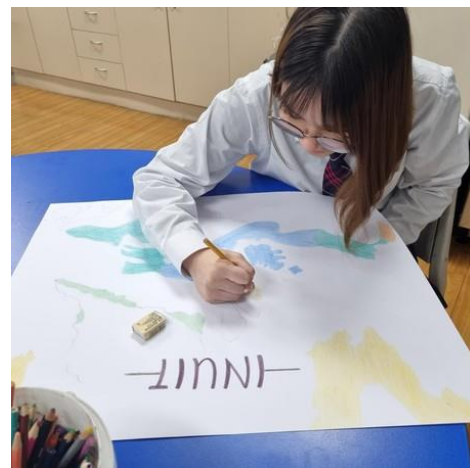
Students are working on their projects