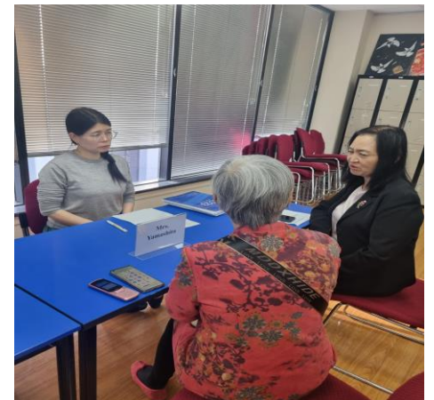
Term 4 Parent Teacher Interview