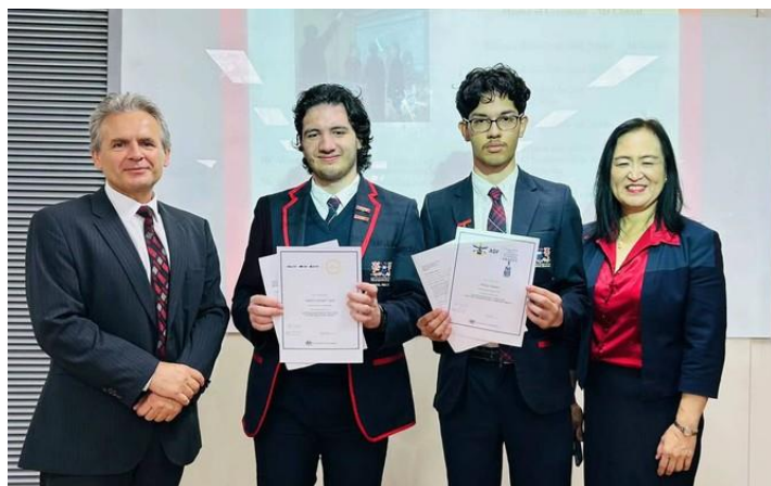
Students received awards on Annual Assembly day