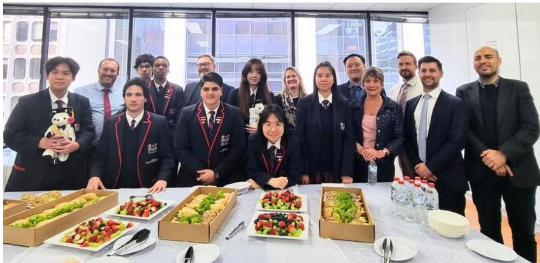
Year 12 Farewell 2023 and MGS Teachers