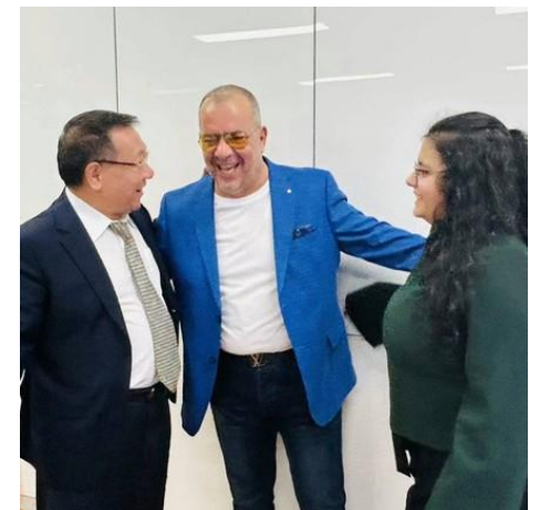
Annual Assembly Day December, 2023