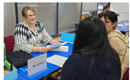
Parent-Teacher Interview Term 4