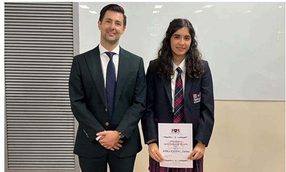
Term 4 Assembly